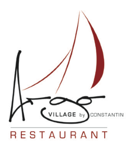
Argo Restaurant Village by Constantin Unique experiences have been prepared for our guests!